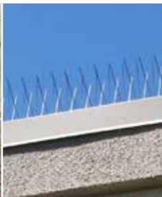
STAINLESS STEEL SPIKES