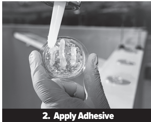
2. Apply Adhesive