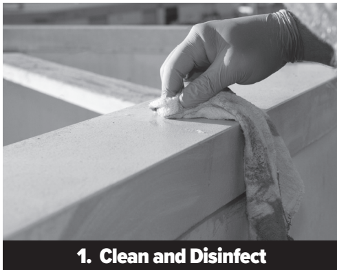
1. Clean and Disinfect