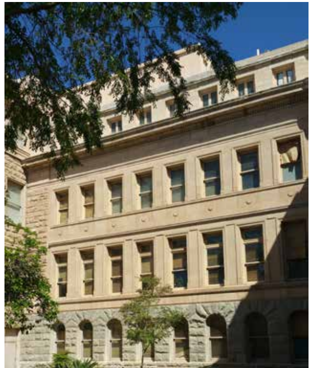
Each window ledge of the building had to have track installed on it.