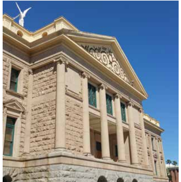
The Arizona Capitol Museum now free from pigeons after installation of Bird•B•Gone®'s "Anti-arcing" Bird Jolt Flat Track®.

Challenges to overcome: The flat track had to be installed on high ledges. The installation team had to work around large gatherings around the building. In addition, visitors and some employees had been feeding the birds, compounding the problem. The Bird Jolt Flat Track® had to be installed in small sections at a time, and had to be done by working on weekends and early mornings. Over 200 pigeons had to be trapped and removed.