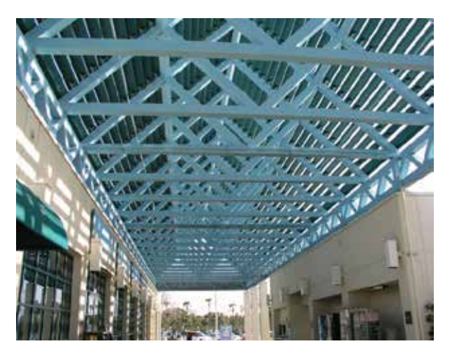
Once installed, the netting becomes virtually invisible and the birds have fled the area.