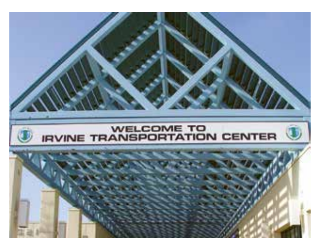
The transit center's architectural design was a safe haven for pigeons and other birds.

Product Details: Bird Net 2000™ is a heavy duty polyethylene netting used to prevent birds from accessing unwanted areas. The bird netting was able to be installed around the perimeter and beneath the roof's beams in order to completely prevent them from physically accessing the area.