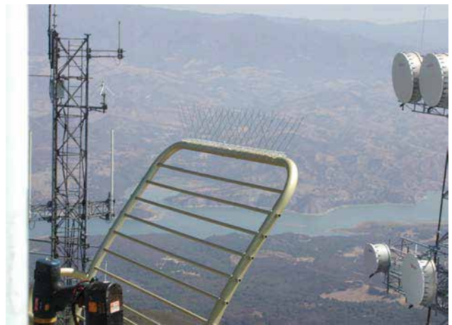
Spikes are a simple, effective, and humane way of preventing birds from landing.