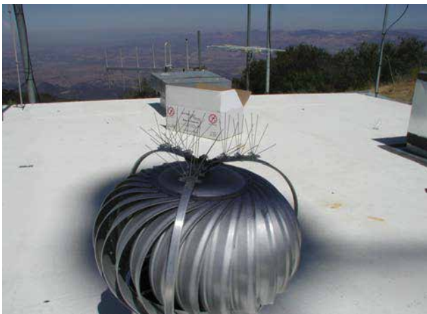
Stainless Steel Spikes come in 2 ft. lengths but can easily cut down to match a desired surface length.

Product Details: Stainless Steel Bird Spikes™ are a physical bird deterrent used to prevent birds from landing. The spikes were installed at the weather station due to the variety of weather extremes that occur at the elevation. Not only will the spikes prevent birds from locating on the station, but they will also remain strong despite weather fluctuation.