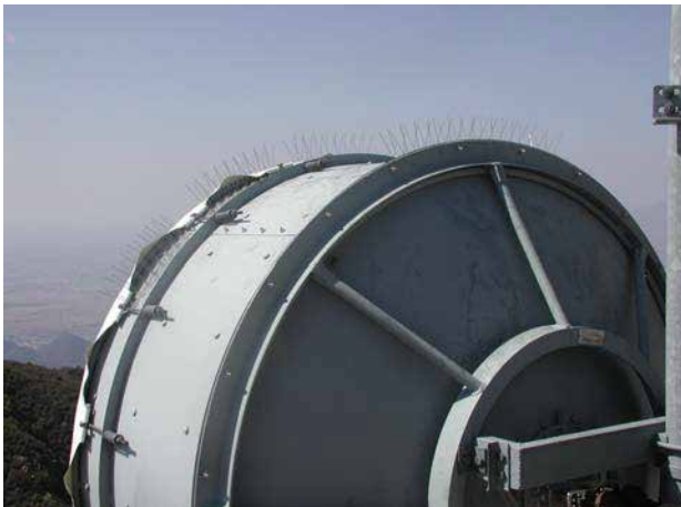
Bird•B•Gone spikes are flexible and can be installed efficiently on flat or curved surfaces.