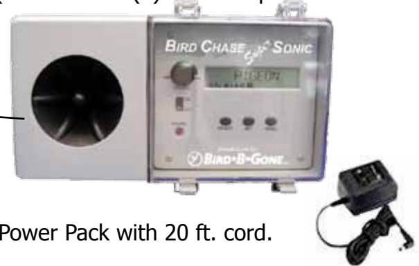
Internal Speaker Pod