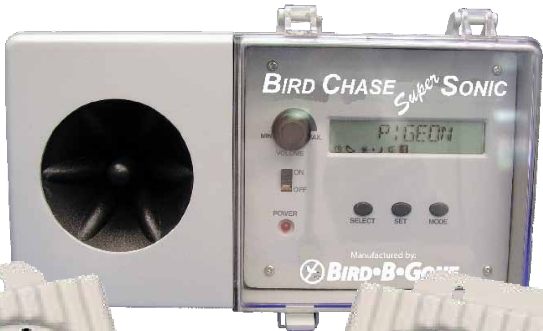
Bird Chase Super Sonic Base Unit