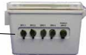
Add Additional Speakers Here!