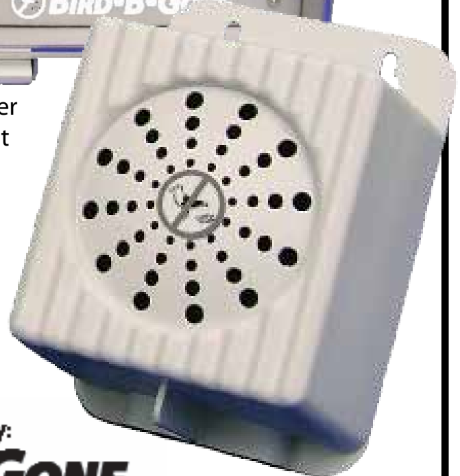
Optional Satellite Speakers