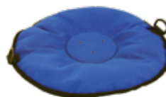
Sand Bag Base