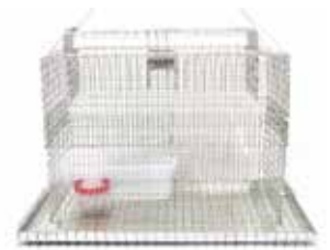
Assembled Sky Trap