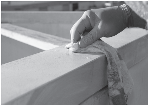
1. Clean and Disinfect