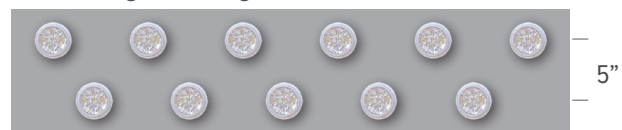
Space dishes every 8 - 10"