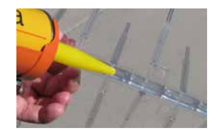
Glue troughs along the base make for easy installation. Bird•B•Gone® offers construction grade adhesives.