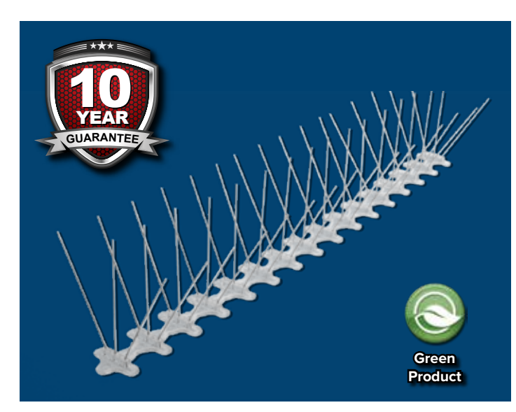
Patented US6250023 US6775950