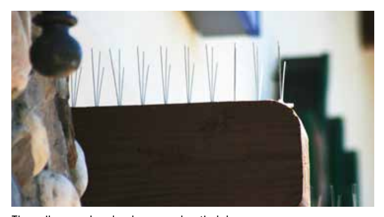
The spikes can be glued, screwed or tied down.