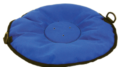
Sand Bag Base