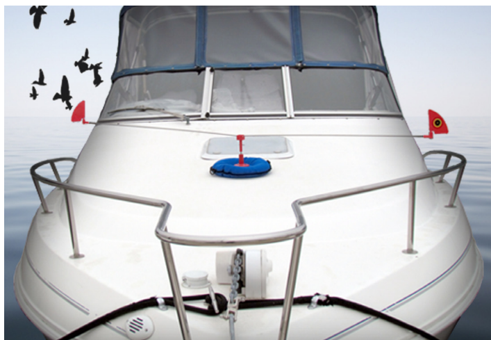
Ideal for use on boats!