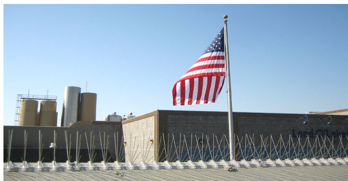
Bird Spike 2001™ installed on a parapet wall.