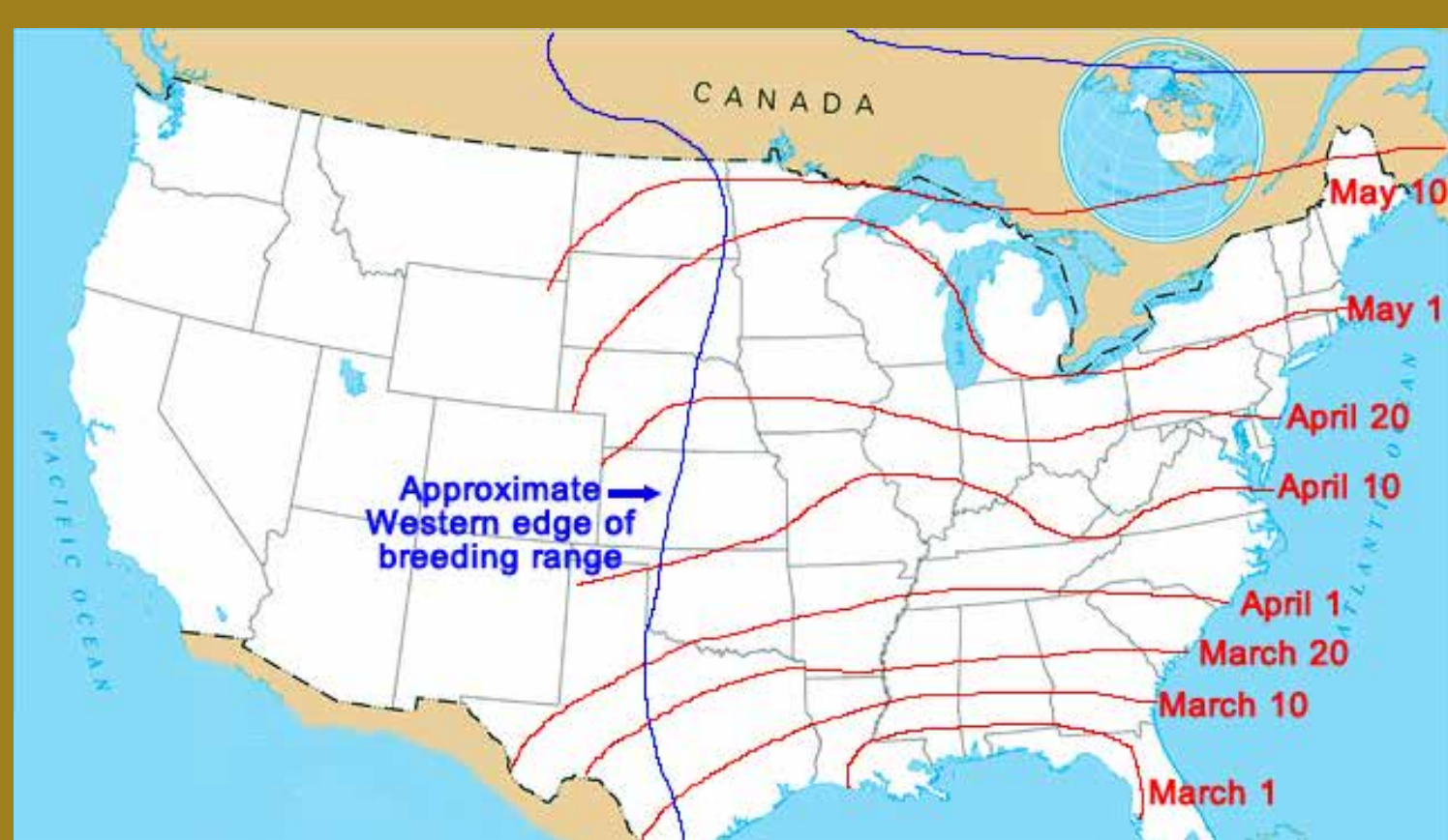
Average Spring Migration Arrival Dates for Ruby-Throated Hummingbirds

Spring brings out flocks of songbirds to announce the season. Birds like house and purple finches, white-breasted nuthatches, song sparrows, and northern cardinals will be arriving. Small but large in number, they'll eat seeds and peck at fruit.